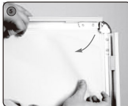
5 Remove the protective cover.