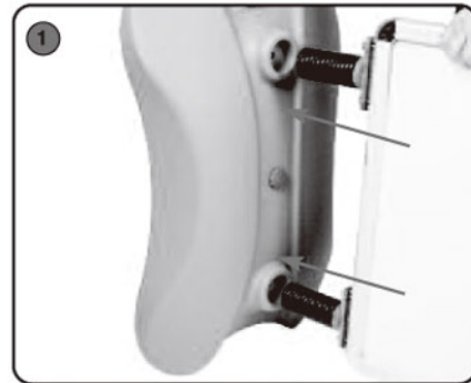
1 Insert the snap frame springs into the moulded base.