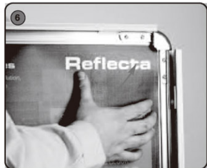
6 Fit the graphic into the snap frame.