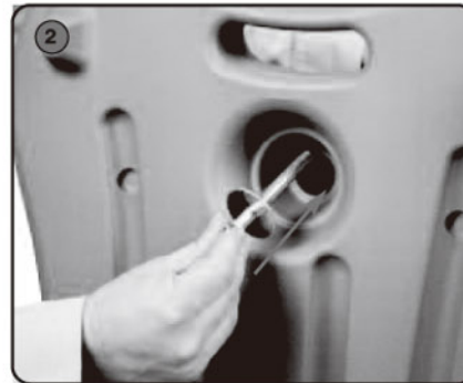
2 Insert bolt and washer through the top of the moulded base.