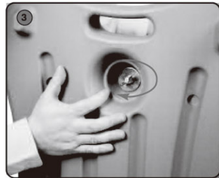
3 Tighten the bolt to secure the snap frame to the moulded base. Repeat steps 3 and 4 for the second bolt.