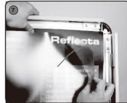
7 Fit the protective cover.