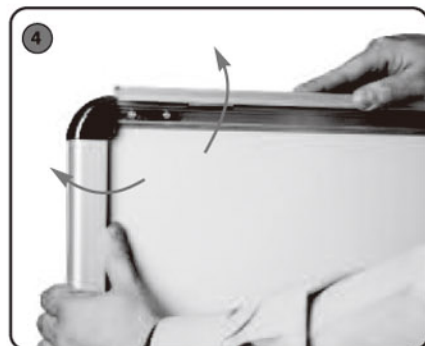
4 Open up the snap frame sides.