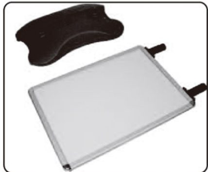
Kit includes: Snap frame, moulded base and 2 x bolts