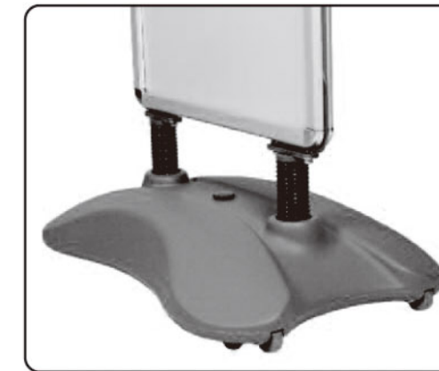
Integral wheels make the stand easy to move

The stand is a heavy-duty double sided swing sign for displaying A1, A0, B1 and B2 size posters. The unit has a wheeled compact moulded base that can be filled with water or sand. The snap frame poster holders make changing your message extremely quick and simple.